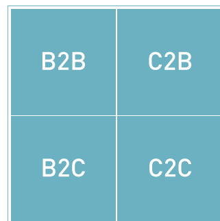
Grid showing types of markets

The connected Internet has had a far greater impact on marketing and business than the ubiquitous email newsletter and the need for search engine optimisation. It is not only the way in which products and services can be marketed that has changed, but new products and services are being developed as well. It has changed the types of products that can be sold, changed the market for products in terms of geography,