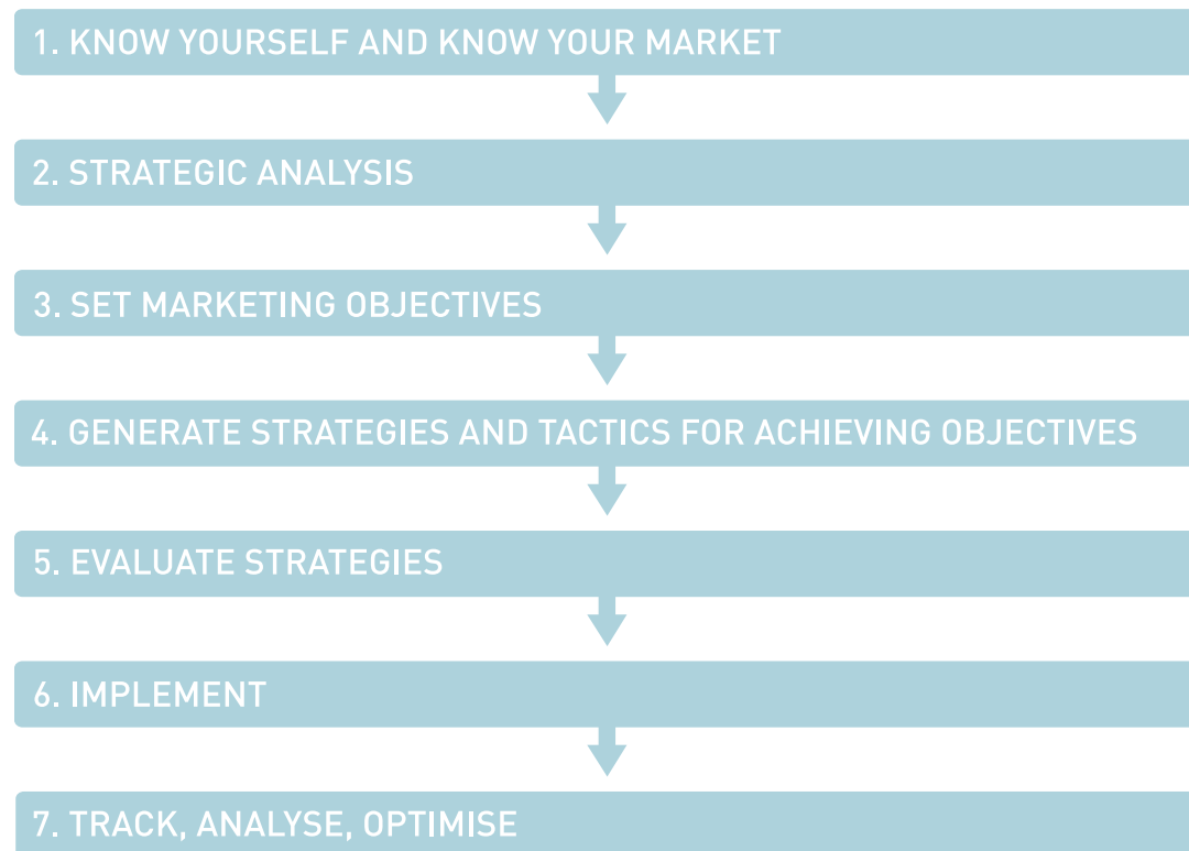
Steps to creating a strategy

An eMarketing strategy should not be created in isolation to an offline strategy. Instead, marketers need to take a holistic view of all business objectives and marketing opportunities. Offline and online activities should complement each other, both having the potential to reach different audiences in different ways. However, the Internet is exceptionally useful as a research and information tool in the strategy process.