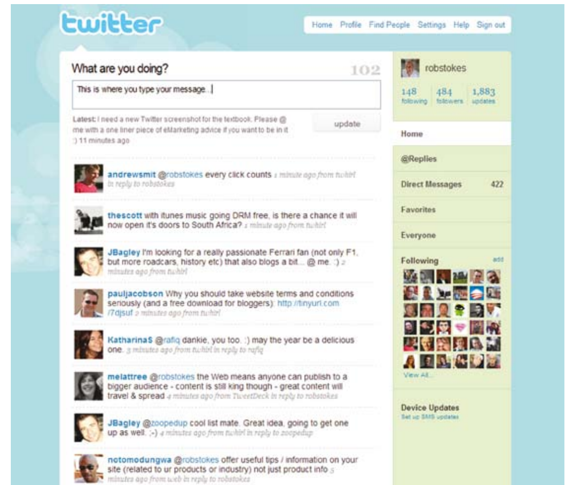
A Twitter feed, appearing at www.twitter.com/robstokes .

Blogs are powerful because of their reach, their archives (information is seldom deleted and is thus available long after it has been posted) and the trust that other consumers place in them. For a marketer, they present opportunities to learn how others perceive your brand and to engage with your audience. Some brands get this right; some get it wrong.